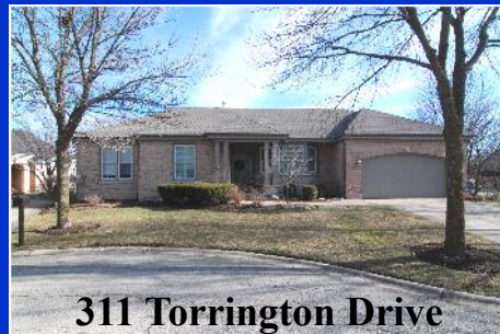
311 Torrington Drive