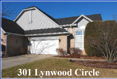
301 Lynwood Circle