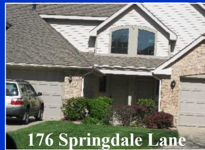
176 Springdale Lane